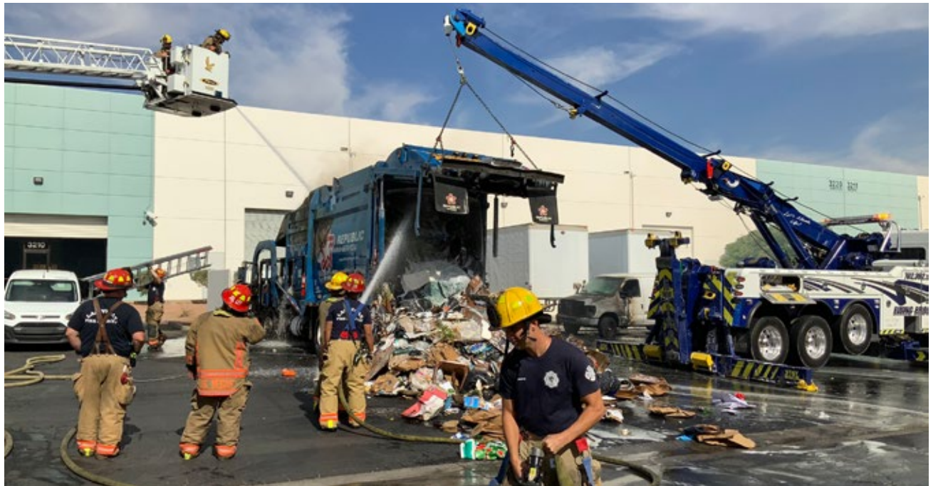
Batteries power our everyday lives, but at the end of their lives, they can present a fire hazard — especially if they are improperly disposed of with household trash. Properly dispose of batteries to avoid fires like this that put the collection driver and surrounding vehicles in danger, damage expensive equipment and risk starting larger fires. If batteries survive the ride in the collection truck, they can start fires in landfills or at materials recovery facilities, where blazes can quickly get out of control.

Historically, we've experienced some truck and facility fires because rechargeable batteries and flammable materials were improperly disposed with recyclables or waste. When a fire occurs in a truck, it is extremely dangerous for the driver, and it also puts surrounding vehicles, pedestrians and properties at risk. At a facility where recyclable paper and plastics are moving rapidly along conveyors, a fire can quickly spread, endangering workers and causing costly facility shutdowns and repairs.